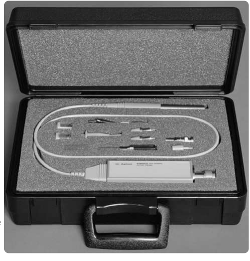
Reliable In-Circuit Signal Analysis

In addition to excellent performance, the 41800A also has a design to protect the probe tip. The probe has a retractable metal sleeve which protects the probe tip from a physical damage when not used and also from electro-static discharge (ESD) damage.